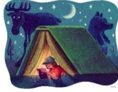
Figure 1: Clipart Image of a tent at night